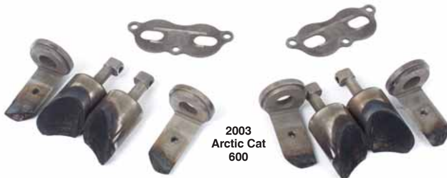
2003 Arctic Cat 600

Subjected to adverse field testing conditions in the Rocky Mountains, including long trail rides, high-RPM powder riding and steep hill climbs, AMSOIL INTERCEPTOR demonstrated superior wear protection and outstanding deposit control.