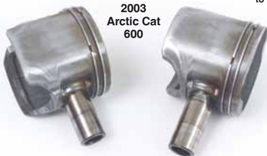
2003 Arctic Cat 600

No carbon deposits are detectable in the functioning region of the exhaust power valves, resulting in "no-stick" performance and continuous valve operation during the field trial. Note: Excess oil was removed with solvent to reveal the true condition of the valves.