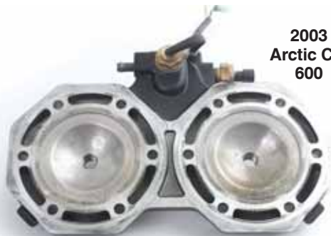
2003 Arctic Cat 600

Pistons show no scoring, little to no wear and no heavy deposits, and wrist pins show no discoloration from heat. In fact, the original machine markings on the pistons are still visible.