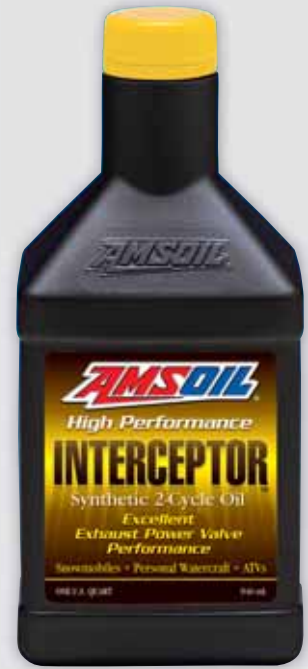
JASO FC • API TC

Extensive research and testing, including a full snowmobiling season in severe Rocky Mountain applications, has proven that wear on cylinders, pistons and bearings is significantly reduced. And with up to 30 percent more detergency and dispersancy additives than typical two-cycle oils, AMSOIL INTERCEPTOR virtually eliminates hard carbon deposits that cause exhaust power valve sticking, ring sticking and preignition-promoting "hot spots" in the combustion chamber.